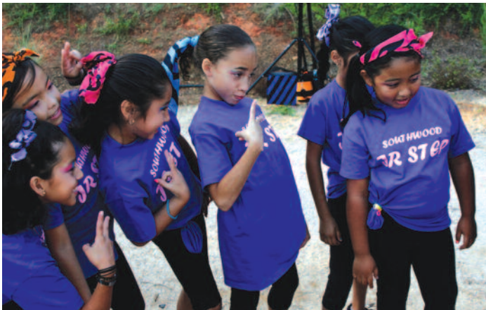
These young ladies are members of the Southwood Junior Steppers, who entertained the crowd at the Southwood Back to School Event.

Representatives from numerous local non-profit and govern-