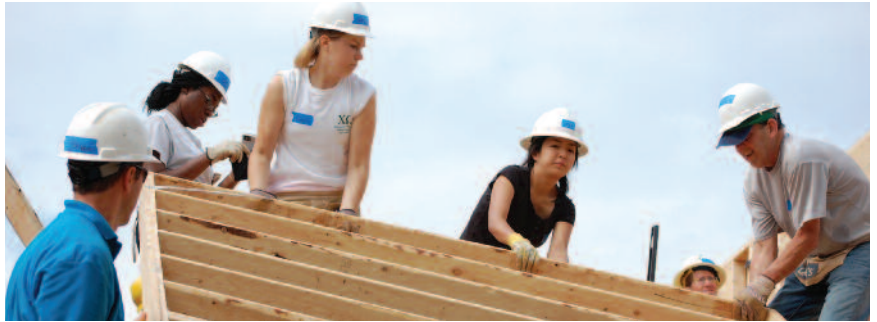
Blitz build teamwork.