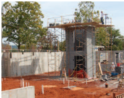
Elevator shaft being built in Apartment-Condo building.

Since pouring the footers in early September, our development partner CMS has made rapid progress on the condo-apartment building that is going up at the corner of Carlton Avenue and Carl Smith Street. Habitat calls this building our "promise keeper," because in addition to providing homes for six Habitat Partner Families and a resident manager, this three story building will keep our promise to the nine original residents of Sunrise Trailer Court who have decided to remain in the neighborhood by providing them with new affordable apartments.