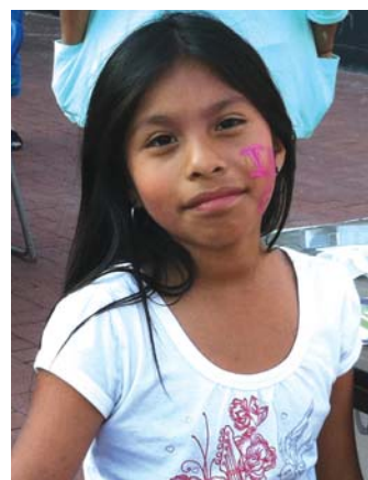
Face painting downtown