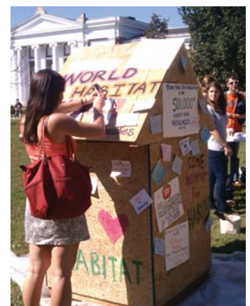
Habitat at UVA's shelter

to decorate banners addressing the issues of natural disasters and the importance of having a home. The banners were displayed on Friday October 7 near the Free Expression Monument on the Charlottesville Downtown Mall. Habitat is grateful to everyone who participated to make this an important week of advocacy. ■