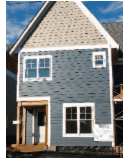
Homes on Midland Street nearing completion in October