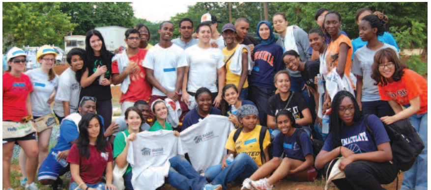
The Blitz Build was pleased to host these hard-working volunteers from the UVA summer program for minority students interested in studying medicine.